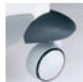
Wheel with brake hose