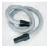
Standard treatment hose