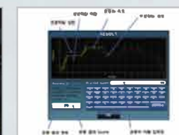
Exercising result information Data