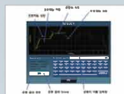
Exercising result information Data