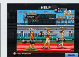
Training with virtual Trainer