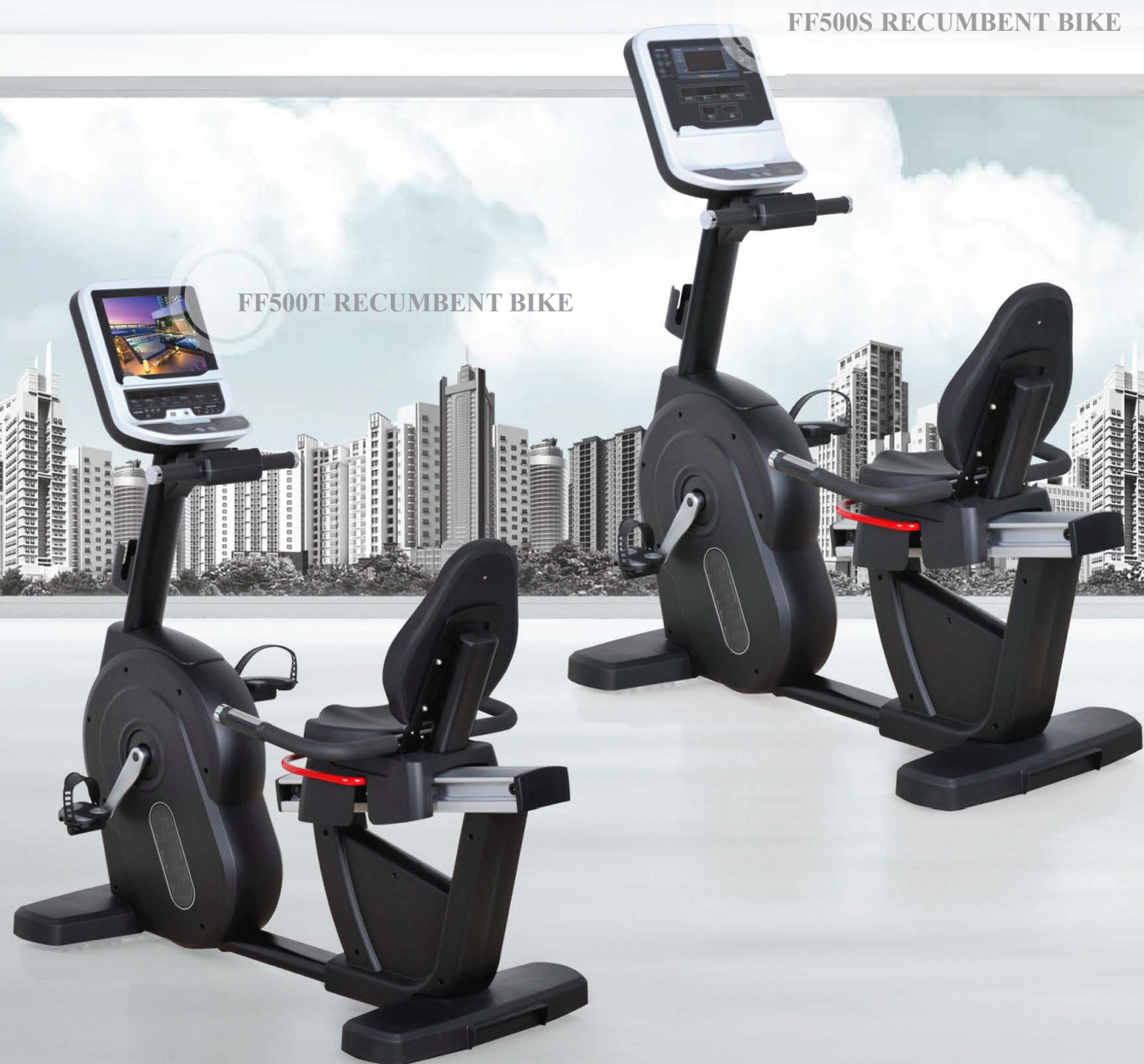
FF500T RECUMBENT BIKE