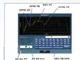
Exercising result information Data