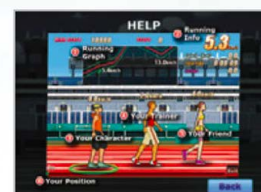
Training with virtual Trainer