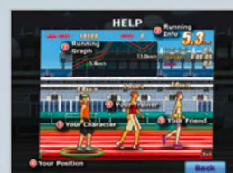
Training with virtual Trainer