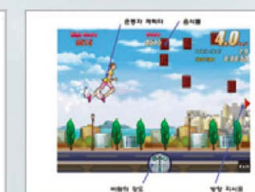
Auto speed control Game