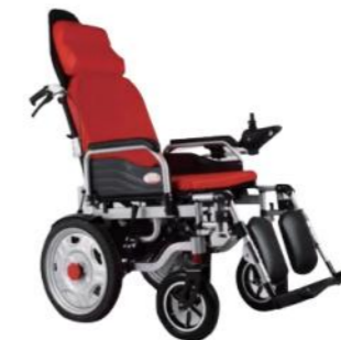
Wheel Chairs JDYZY113E 1130x635x1280mm