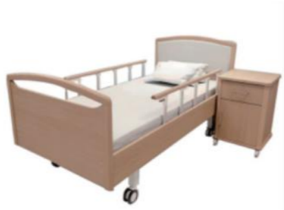
Two Functions Nursing Bed JDCJJ-HL110A 2060x1010x500mm±20