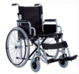
Wheel Chairs JDYZY113J 1020x630x920mm