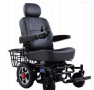
Wheel Chairs JDYZY113M 1200x580x1030-1100mm