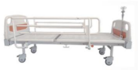
Single Function Nursing Bed JDC-DY111B3 2080x960x500mm±30