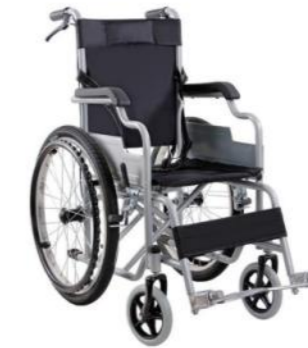
Pediatric Wheel Chairs JDYZY113H1 900x550x880mm