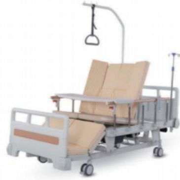
Electric Lateral Tilt Nursing Bed JDCJJ-HL221B 2060x1120x470-740mm±20