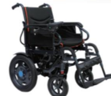
Wheel Chairs JDYZY113L 1130x690x730-960mm