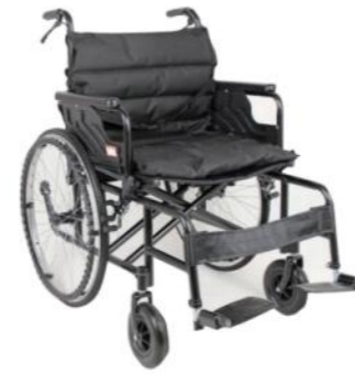
Large Wheel Chairs JDYZY113F1 1100x750x920mm