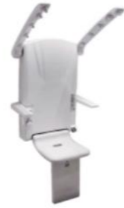
Shower Chair JDYZY-LYY-066 1360x715x546mm