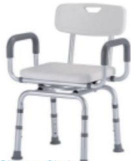
Shower Chair JDYZY-LYY-008 540x510x710-790