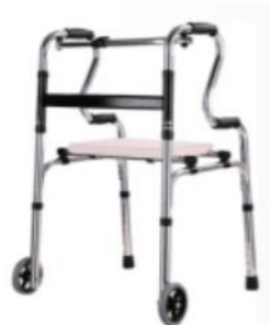
Wheeled Walker JDYZY-ZXQ-03 490x490x740mm