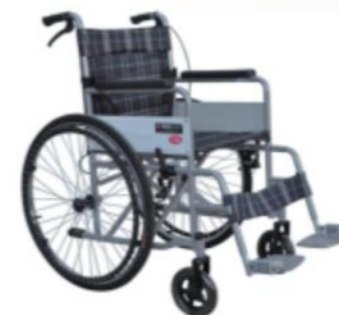
Wheel Chairs JDYZY113K 1020x660x930mm