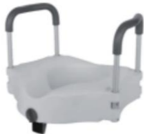
Toilet Seat Raiser JDYZY-ZL068 415x505x115mm