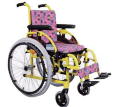
Pediatric Wheel Chairs JDYZY113H2 1030x490x920mm