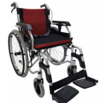
Wheel Chairs JDYZY113C 1095x640x900mm