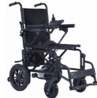
Wheel Chairs JDYZY113D 980x590x940mm