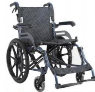
Wheel Chairs JDYZY113A 970x640x855mm