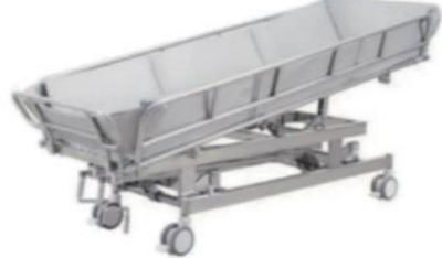
Stainless Steel Bath Bed JDCJJ-XZ112A 2050x800x480mm-780mm±20