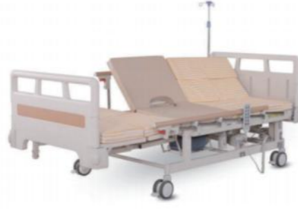
Electric Lateral Tilt Nursing Bed JDCJJ-HL221A 2060x960x520mm±20