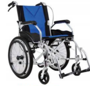
Wheel Chairs JDYZY113B 960x650x880mm