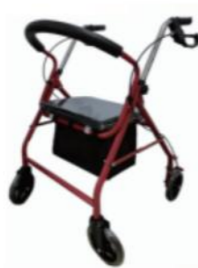
Shopping Walker JDYZY-ZXQ-09 630x540x850-900mm